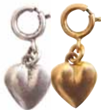
LARGE HEART CHARM D: 9/16" x 1/2" Antique Silver - jlhs-b Antique Gold - jlhg-b