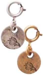
MINI CIRCLE FLOWER D: 1/2" Antique Silver - jmcfsb Antique Gold - jmcfgb