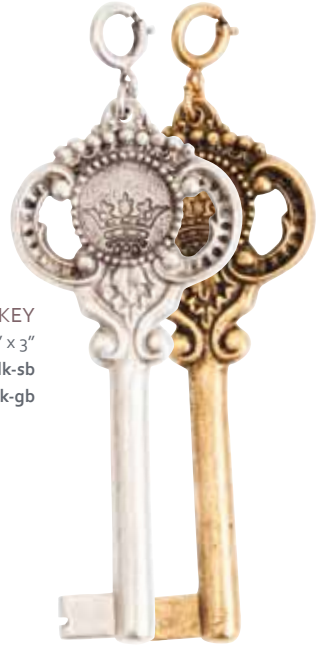
LARGE KEY ID: 1/4" D: 1/2" x 3" Antique Silver - jlk-sb Antique Gold - jlk-gb