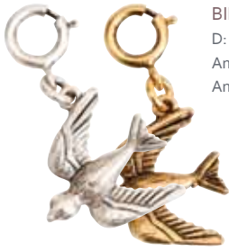
BIRD CHARM D: 3/4" Antique Silver - jbcbs-b Antique Gold - jbcg-b