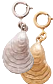
OYSTER CHARM D: 1" x 13/16" Antique Silver - jocs-b Antique Gold - jocg-b