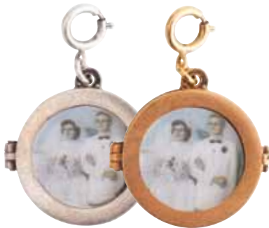
SMALL LOCKET PLAIN D: 1-1/16" Antique Silver - jslp-sb Antique Gold - jslp-gb