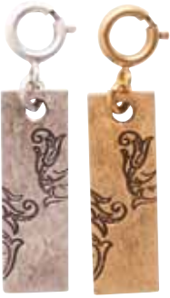
LARGE THIN VINE D: 1-3/16" x 1/4" Antique Silver - jltv-sb Antique Gold - jltv-gb