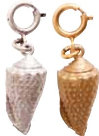
CONCH CHARM D: 1" x 7/16" Antique Silver - jcocs-b Antique Gold - jcocg-b