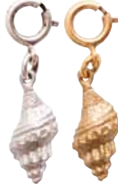
TRUMP CHARM D: 7/8" x 3/8" Antique Silver - jtscs-b Antique Gold - jtscg-b