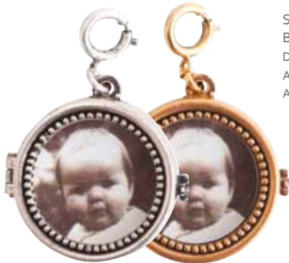
SMALL LOCKET BEADED D: 1-1/16" Antique Silver - jslb-sb Antique Gold - jslb-gb