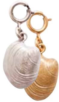
CLAM CHARM D: 7/8" x 5/8" Antique Silver - jcscs-b Antique Gold - jcscg-b