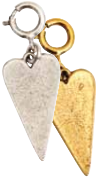
ELONGATED HEART CHARM D: 1" x 1/2" Antique Silver - jehcs-b Antique Gold - jehcg-b