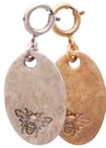
LARGE OVAL BEE D: 1" x 11/16" Antique Silver - jlob-sb Antique Gold - jlob-gb