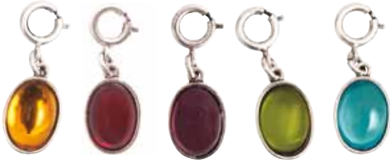
Sienna jmlsos-sb Scarlato jmlsosc-sb Violato jmlsov-sb Olivine jmlsoo-sb Azurro jmlsoaz-sb

MINI LINK SMALL OVALS D: 3/4" x 1/2" Antique Silver