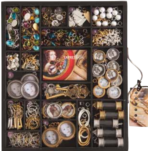
ADORNMENT TRAY D: 10-1/4" x 12-1/4" Black - jat

Each display component is retail ready, with an easily coded system for pricing and description.