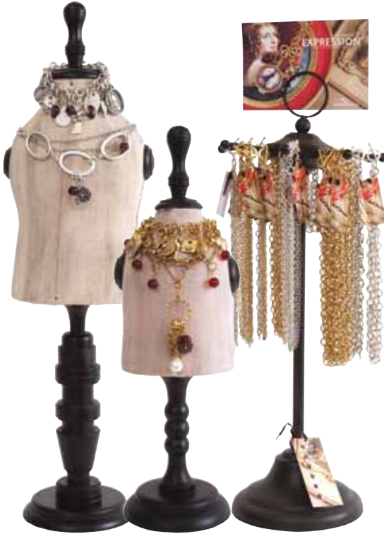
VINTAGE MANNEQUIN TALL D: 22" x 6" x 4" Muslin - jvmt