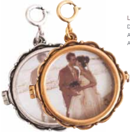
LARGE LOCKET SCALLOP D: 1-1/2" Antique Silver - jlls-sb Antique Gold - jlls-gb