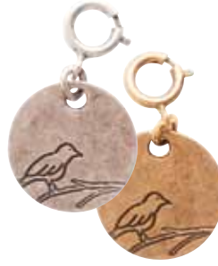
SMALL CIRCLE BIRD D: 13/16" Antique Silver - jscb-sb Antique Gold - jscb-gb