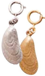
MUSSEL CHARM D: 1" x 1/2" Antique Silver - jmc-sb Antique Gold - jmc-gb