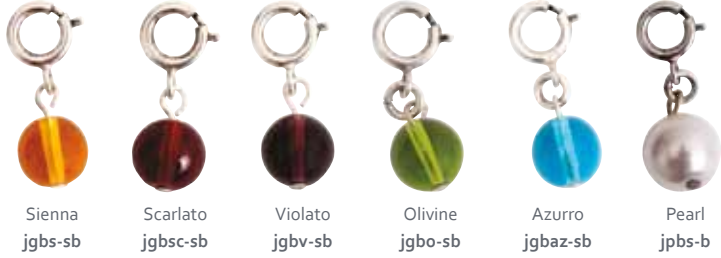
Sienna jgbs-sb Scarlato jgbsc-sb Violato jgbv-sb Olivine jgbo-sb Azurro jgbaz-sb Pearl jpbs-b

GLASS & PEARL BEADS Glass D: 8mm Pearl D: 12mm Antique Silver