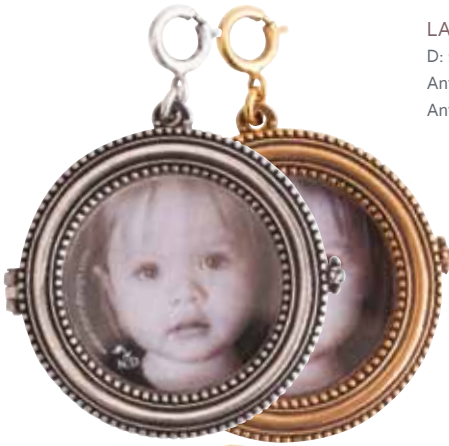
LARGE LOCKET BEADED D: 1-3/4" Antique Silver - jllb-sb Antique Gold - jllb-gb