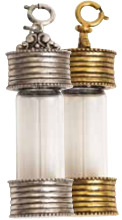
GLASS KEEPSAKE PENDANT D: 2-3/8" x 3/4" Antique Silver - jgkp-sb Antique Gold - jgpk-gb