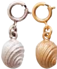
SNAIL CHARM D: 5/8" x 3/8" Antique Silver - jscs-b Antique Gold - jscg-b