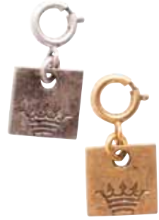
MINI SQUARE CROWN D: 1/2" Antique Silver - jmcs-sb Antique Gold - jmcs-gb