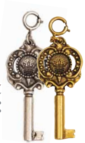
SMALL KEY ID: 3/8" D: 7/8" x 2" Antique Silver - jsk-sb Antique Gold - jsk-gb