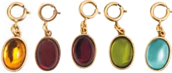
Sienna jmlsos-gb Scarlato jmlsosc-gb Violato jmlsov-gb Olivine jmlsoo-gb Azurro jmlsoaz-gb

MINI LINK SMALL OVALS D: 3/4" x 1/2" Antique Silver