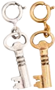
KEY CHARM D: 1" x 3/8" Antique Silver - jkcs-b Antique Gold - jkcg-b