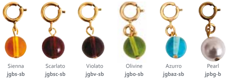
Sienna jgbs-sb Scarlato jgbsc-sb Violato jgbv-sb Olivine jgbo-sb Azurro jgbaz-sb Pearl jpbg-b

GLASS & PEARL BEADS Glass D: 8mm Pearl D: 12mm Antique Gold