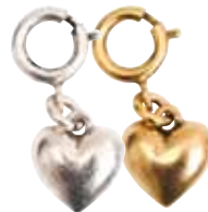
SMALL HEART CHARM D: 1/4" x 7/16" Antique Silver - jshs-b Antique Gold - jshg-b